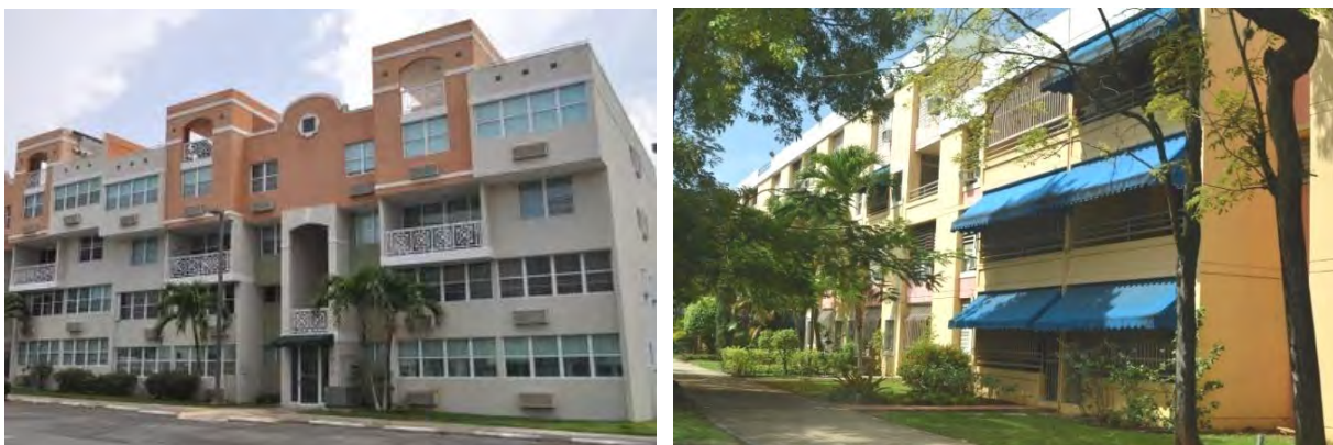
Figure 2: Typical "walk-up" multi-family dwellings in Puerto Rico

In Puerto Rico, multi-family dwellings with 2-4 stories are referred to as "walk-ups" because there are no elevators and occupants use stairs to access the upper floors. Figure 2 shows a typical "walk-up" in San Juan, Puerto Rico.