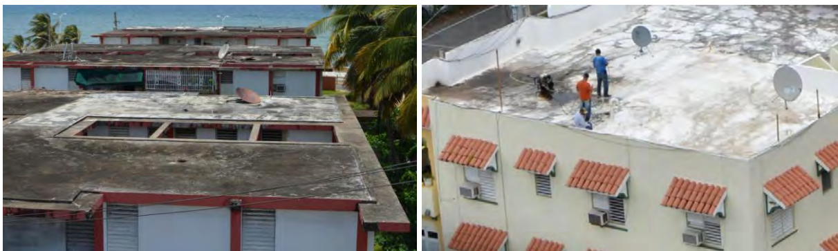
Figure 3: Typical reinforced concrete roof deck

The roofs are reinforced concrete decks that are generally five to six inches thick. They are essentially flat with a minimal slope for water drainage (Figure 3). Most roofs are covered with either paint or a chemical that combines with the concrete to prevent leakage. When a built-up roof cover is used, the cover is a thermoplastic polyolefin (TPO) membrane or something similar. Gravel is almost never used on the roofs of MFD buildings, even when the roof cover is built-up. Parapets are also common and generally range from a few inches to four feet in height.