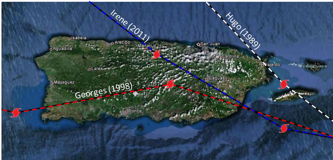
Figure 1: Major hurricanes to impact Puerto Rico

Hurricanes in the North Atlantic Basin cause widespread damage to the Caribbean islands on a regular basis. Puerto Rico is highly susceptible to landfalling hurricanes that usually move in an east to west direction across the island. The last two major hurricanes to impact the island are Hurricanes Hugo (1989) and Georges (1998), each causing significant damage (Figure 1). More recently, Hurricane Irene (2011) made landfall as a category 1 hurricane but did not cause significant damage.